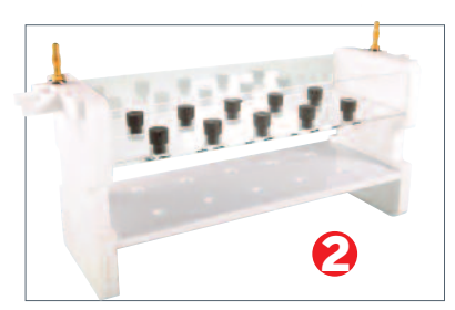
Capillary IEF module, VS10WDCI

Each Modular System comprises the Gel Chamber, PAGE Internal Running Module, Casting Base and various accessories. Through the addition of further modules, the packages flexibility is increased to allow Western blotting and Capillary IEF.